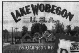
On Saturday, Garrison Keillor plans to greet his radio listeners with a phrase he hasn't used since 1987: "Hello, everybody, and welcome to 'A Prairie Home Companion.'" He says his show's old title, which he adapted from the Prairie Home cemetery in Moorhead, Minn., is a memorable name that "wears well."