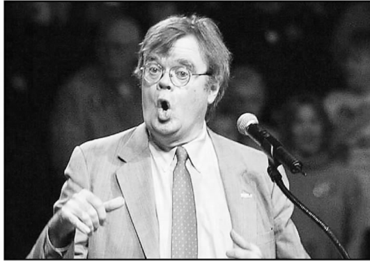
Garrison Keillor brings his "Prairie Home Companion" tour to the Santa Fe Opera on Tuesday.

Half of the singing cowboy duo Dusty and Lefty will appear.