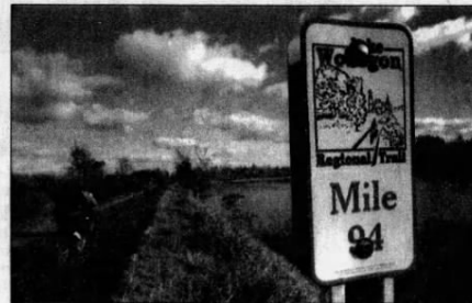
Bicyclists passed a mile marker sign Wednesday on the Lake Wobegon Regional Trail outside Albany.

were U.S. Reps. Collin Peterson and James Oberstar, who biked from the Stearns County Fairgrounds in Sauk Centre to Albany. Both congressmen were enthusiastic about the trail.